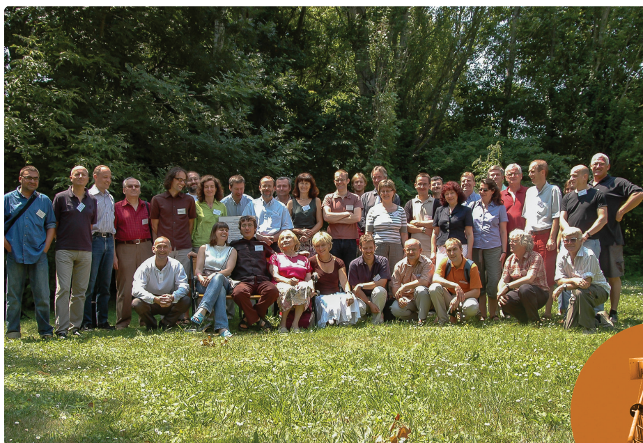
Members of the eLTER community at the formal launch of the pan-European LTER-Europe network in 2007. The meeting took place at Lake Balaton, Hungary

Integrated European Long-Term Ecosystem, critical zone and socio-economical systems Research